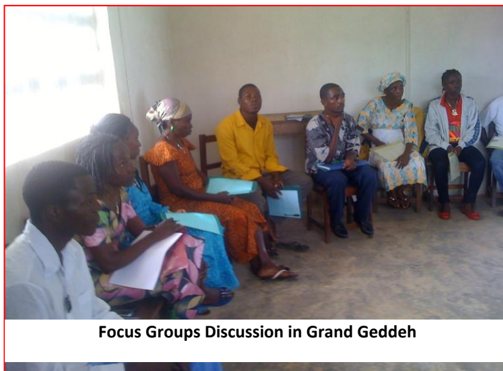
Focus Groups Discussion in Grand Geddeh

3.1 A Focus group discussions (FGDs) and consultations with key stakeholders were held in 11 of the 15 counties in Liberia (Capemount, Bomi, Gbarpolu, Bong, Bassa, Nimba, Lofa, Grand Geddeh, River Gee, Rivercess and Margibi) with leaders and representatives of women group, youth group, GBV Observatories Networks, members of the GBV county task forces, GBV actors and service providers, Law Enforcement officers and court officials. A team of three (3) staff from the Ministry of Gender and Development and the Joint Program on SGBV conducted the FGDs in the selected counties. A facilitators' guide produced by the Program Advisor of the Joint Program was used as the tool for the FGDs and consultations. A total of 385 participants (30-40 participants per county) attended the FGDs, of which 60% were women. The meetings were interactive and participants discussed issues concerning Domestic violence , it occurrence, forms and its impact on individuals, family and community. At the close of each discussion participants made specific recommendations and suggestions on what should be included in the proposed law and possible solutions.