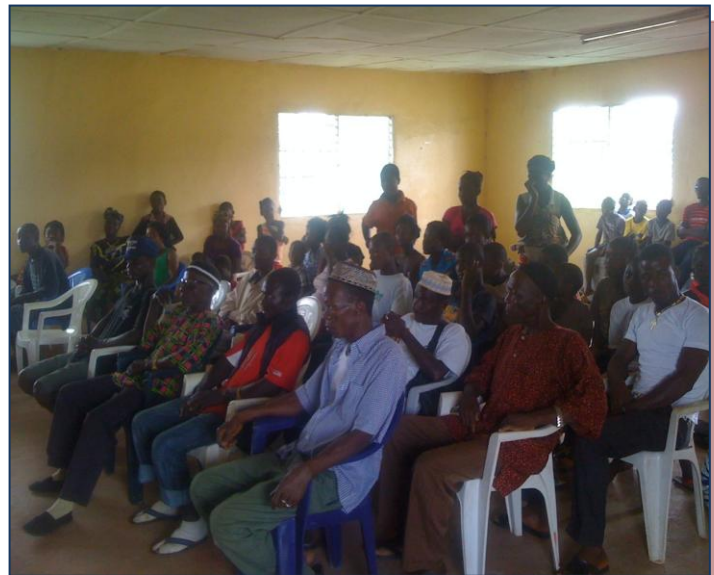
DVL Focus Groups Discussion in Nimba County

In an effort to develop and enact a comprehensive legislation to protect women and children in households across the country, the Ministry of Gender and Development with the support of partners hired the services of a National Consultant to gather information from the field that will enhance the review of the National domestic